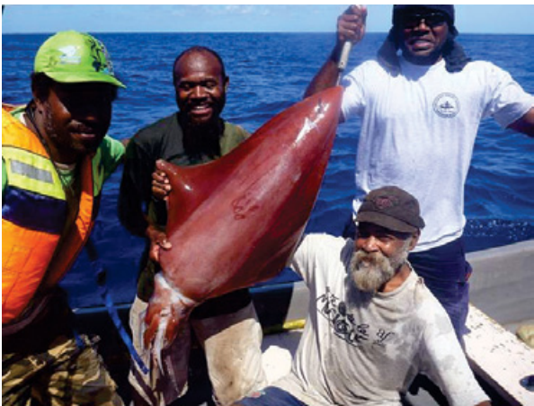
Figure 2. First diamondback squid catch at Aneityum Island, Vanuatu.