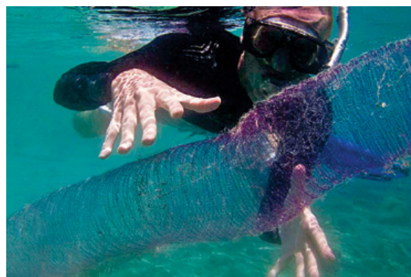
Figure 5. A diamondback squid egg mass at Madang in Papua New Guinea (source: https://morealtitude.wordpress.com/2008/10/13/ , downloaded on Thursday 17 July 2014).